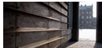
Bohaterów Getta Square, Krakow, Poland Architect: Lewicki & Latak. Completed: 2006

international recognition and whose design principles, both aesthetic and thematic, are still being repeated in many projects across Europe today.