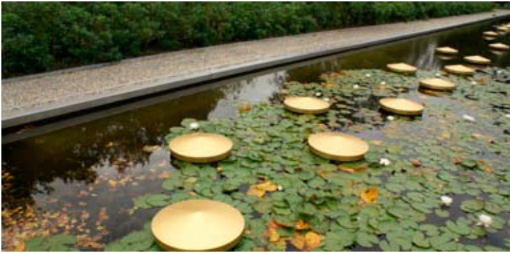
Cemetery 'De Nieuwe Ooster', Amsterdam, Netherlands Architect: Karres & Brands. Completed: 2007