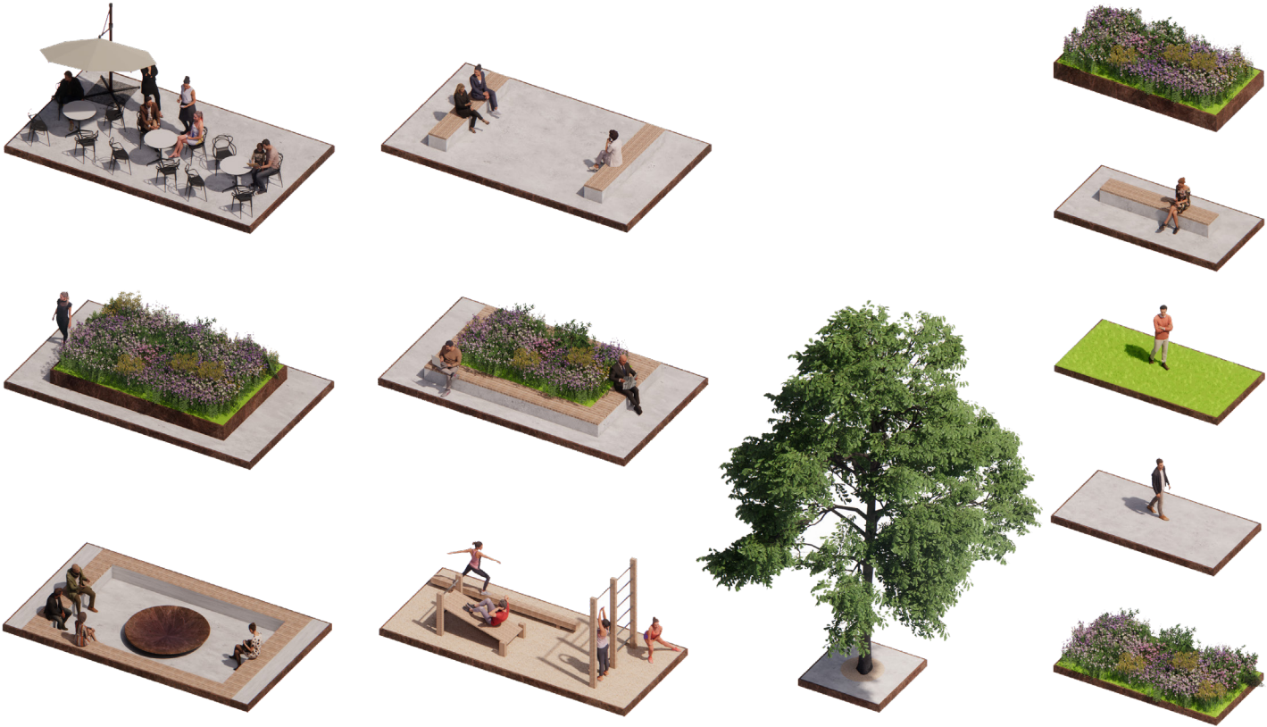
Landscaping module concept