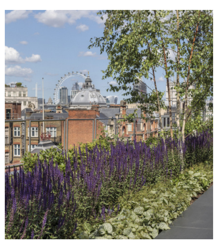
"The landscape design at Buckingham Green enlivens the public realm with a warm palette of refined materials, whilst a colourful planting scheme for occupants of The Caxton creates a new terraced space to enjoy views out across London." - Martin Koenig, Associate