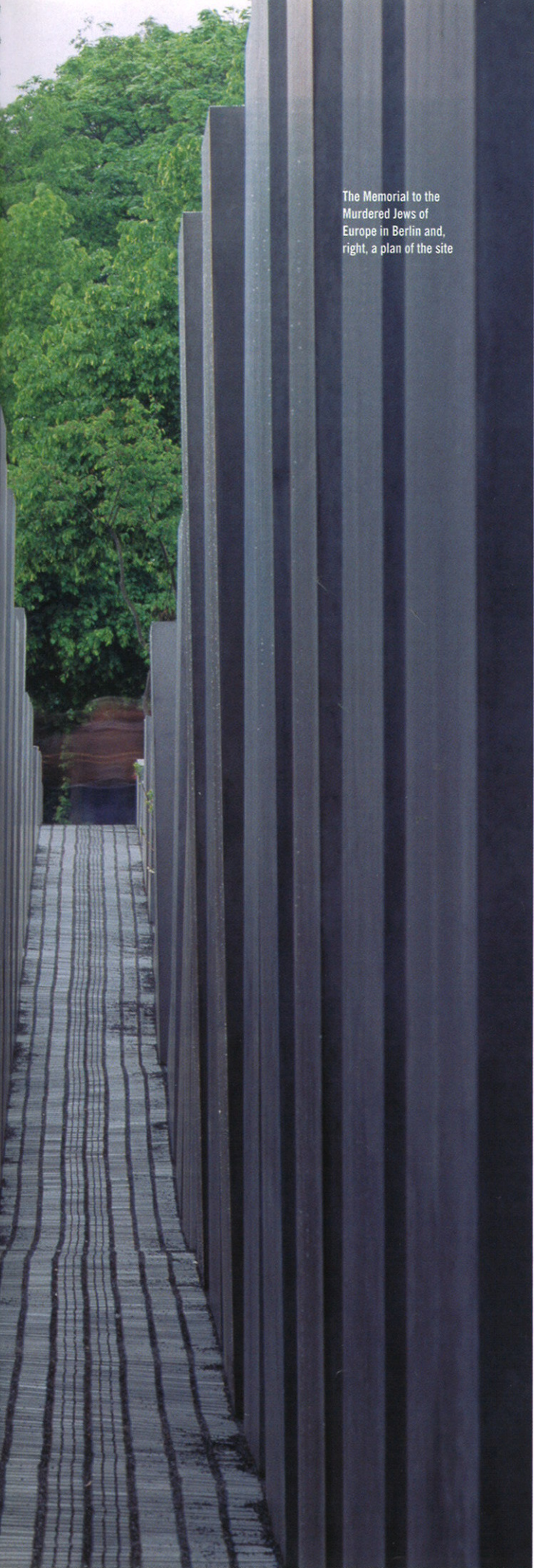
The Memorial to the Murdered Jews of Europe in Berlin and, right, a plan of the site