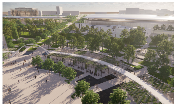
YMCA Square aerial view with pergola and café