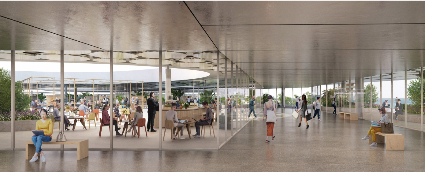
V3 - Exhibition Hall 2 / View from "Vasari Corridor" towards