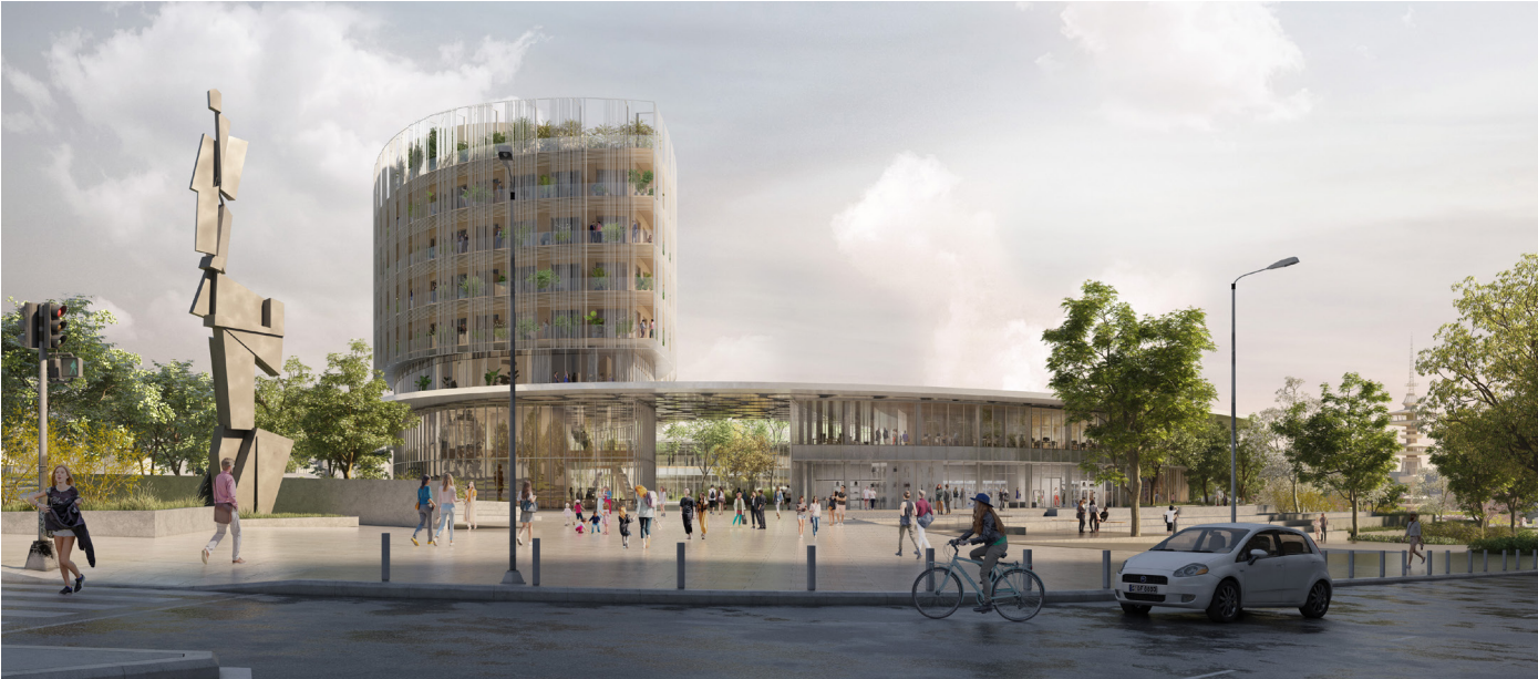
V2 - Arrival Square view from Egnatia/Aggelaki junction