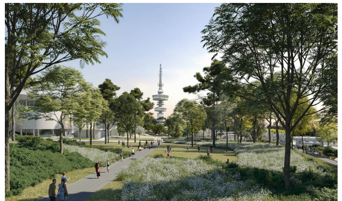
Culture Path view towards OTE Tower the sea

The Water Management Strategy across the site is to collect the rainwater from hard paved areas and new building roofs to be re-used for irrigation and provide water supply for the untreated water for the vegetated water features. In addition to this, a series of dry swales will also act as attenuation devices to mitigate stormwater events. Ideally any excess of water will also be conveyed to an underground collection/attenuation system to further provide water supply.