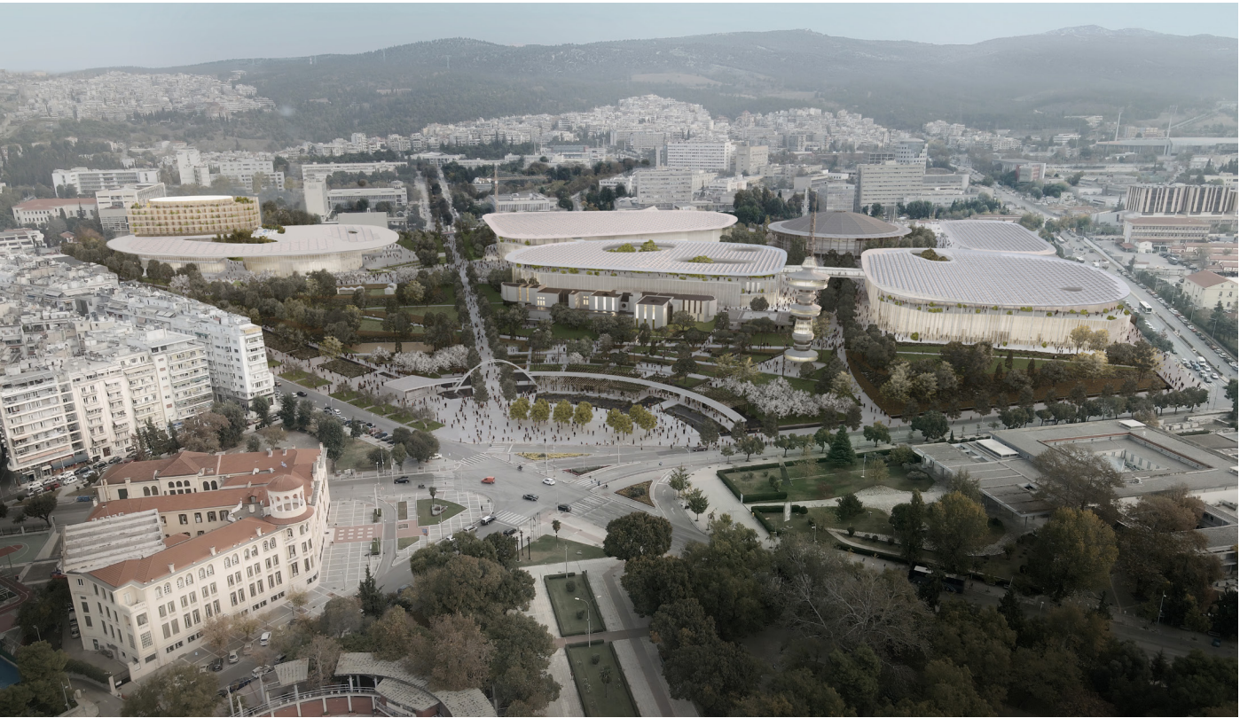
V1 - ConfEx Park aerial view / From Mountain to Sea