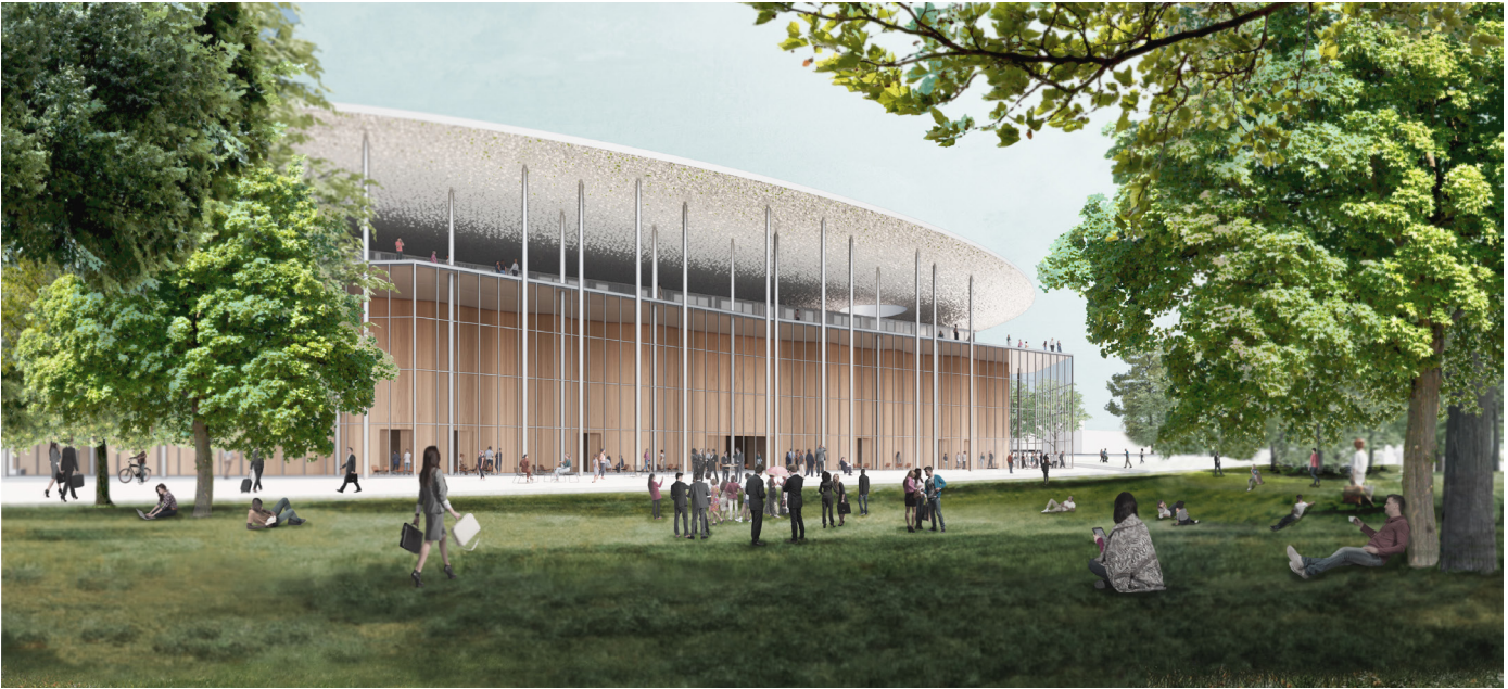
V4 - View from Amphitheatre Meadow to Congress Hall