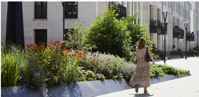
Bourne Walk (above) is a continuous ecological corridor the length of Chelsea Bridge Road. Conceived as an elegant walk framed by native hedgerows and biodiverse planting, the natural character enhances the original railings and London Plane trees of the Barracks. The continuous movement of water along the rill guides the visitor on their walk and planting provides a landscape for larger species of birds and wildlife.