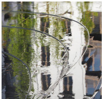
Dove Place (above) marks the entrance to the site from Pimlico, framed by bronze and granite planters. 'Bicameral' by Conrad Shawcross sits within the largest planter, surrounded by low, evergreen planting. Conceived as an open woodland, character is refined and understated, coming to life in early spring, with white, yellow, and blue flowering woodland bulbs.