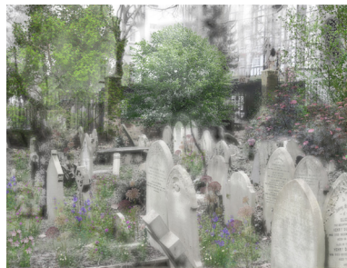
Views of the East Cemetery