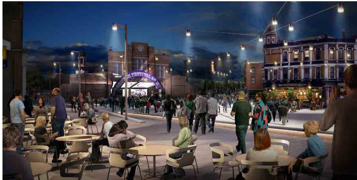
BERESFORD SQUARE EVENING RENDERING