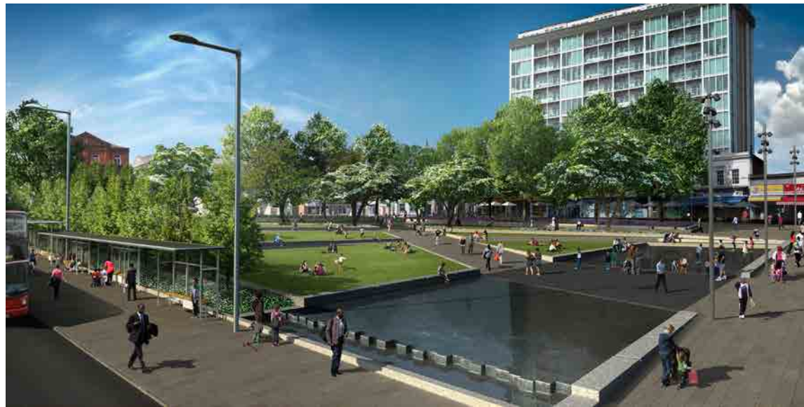
GENERAL GORDON SQUARE WATER FEATURE RENDERING

The town center was fragmented due to the road layout which separated the green space of General Gordon Square from Greens End, Beresford Square and the rest of the town center.