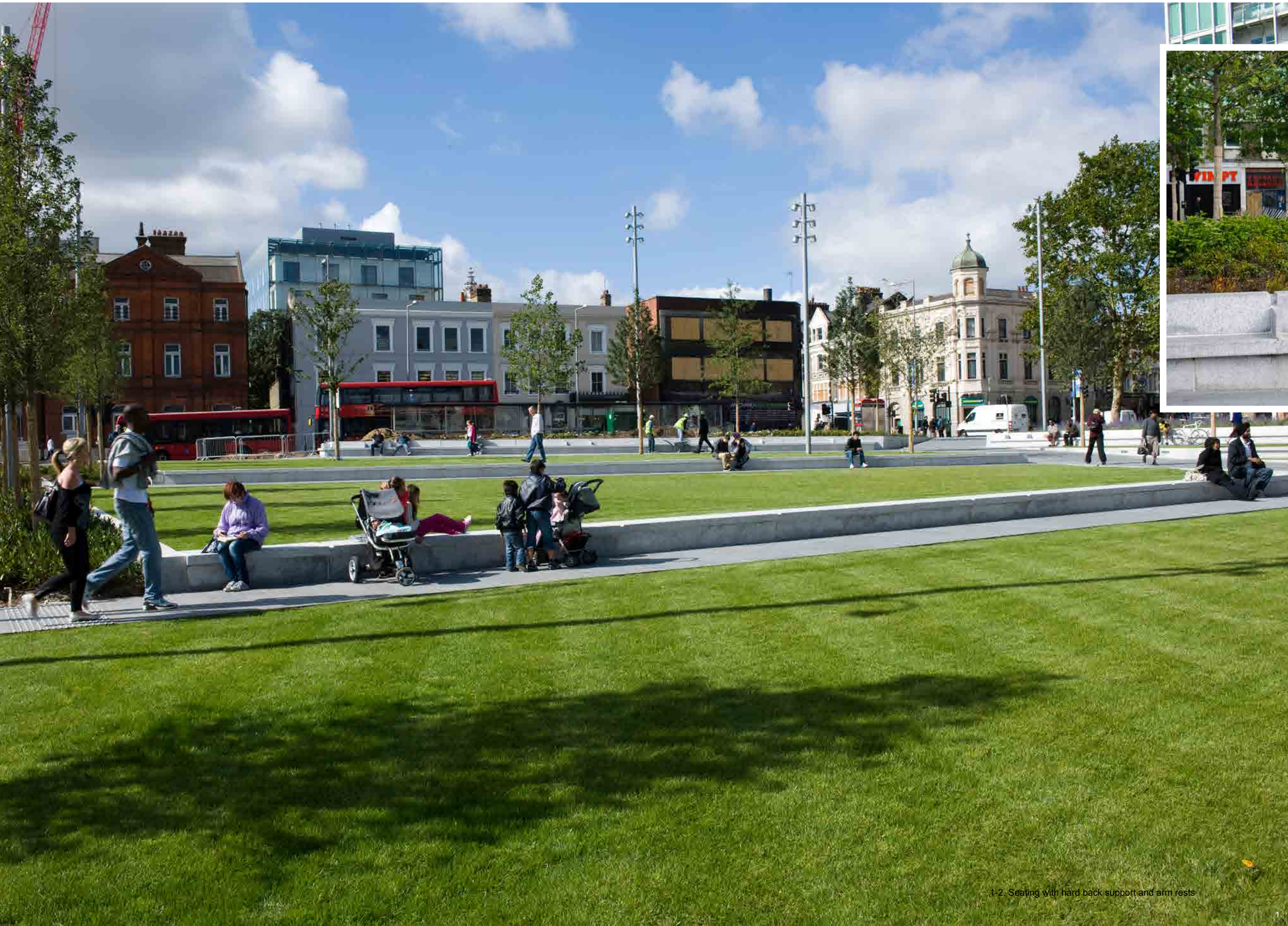
1-2 Seating with hard back support and arm rests