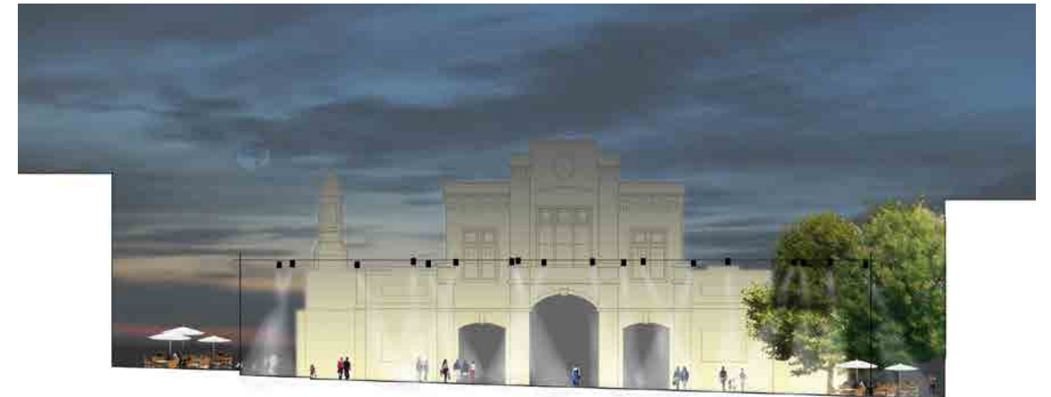
BERESFORD SQUARE SECTION

were specified for their robustness and appearance, and the choice of colors tied into previously completed TfL street works, grounding the design into the broader context of Woolwich, strengthening the natural link from Woolwich Common to the River Thames.