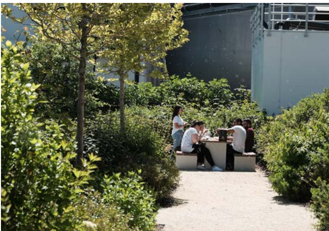
View from Woodland Gardens