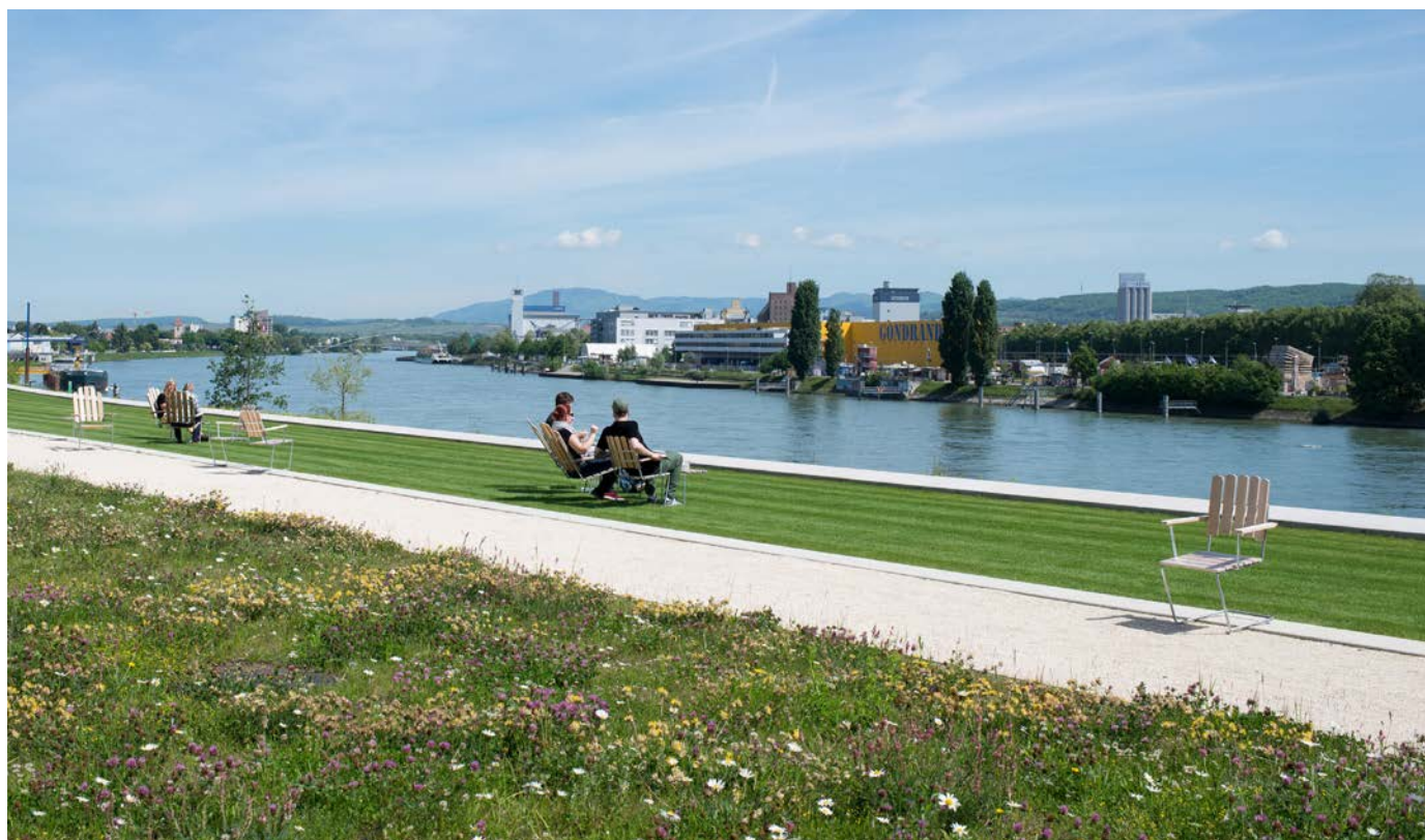
Wildflower meadow overlooking the River Rhine