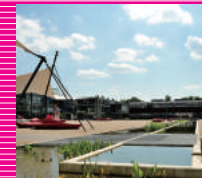
PUBLIC OPEN SPACE 城市空间