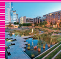
CITY PARK 城市公园