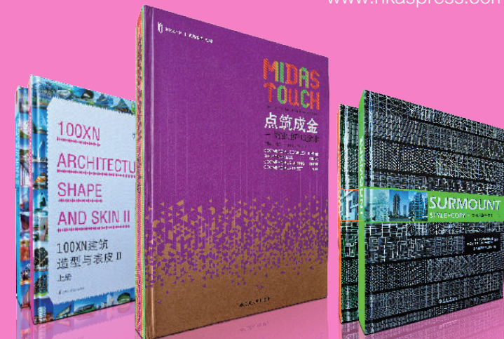
左:《100×N 建筑造型与表皮 2》 中:《点筑成金——商业地产吸金术》 右:《突破风格与复制 2》