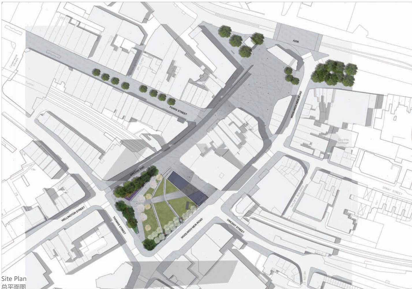
Site Plan 总平面图