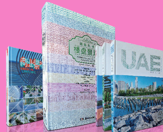
左:《商业景观》 中:《国际风格楼盘景观》 右:《世界景观设计 100 强》