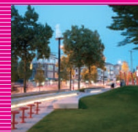
POCKET PARK 人文社区