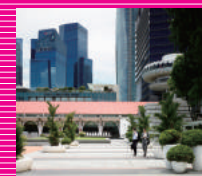
CITY SQUARE 城市广场